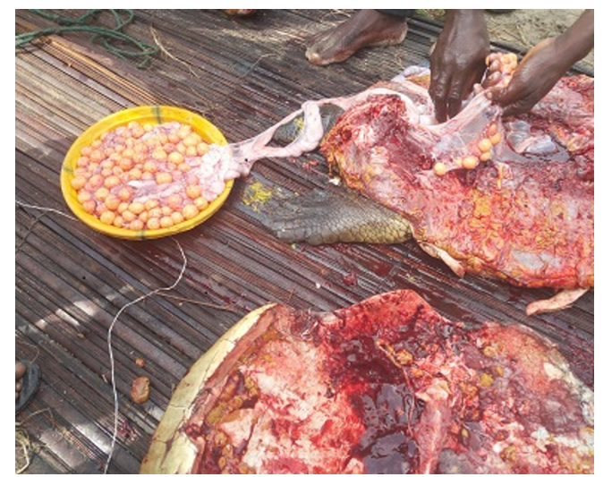
Fig. 3. Female sea turtle slaughtered immediately after a fishing trip in Ilaje.

However, sales of sea turtle are gender friendly in the study area as both male and female are involved in these. This observation is similar to Adebayo & Pitan (2003), stating that about 64.2% women are actively involved in turtle marketing. In Ilaje, sea turtles are only consumed as meat. Elsewhere, these animals are known to be highly utilised in zoo-therapy and alternative medicine (Begossi et al., 2004) as well as in communities in the southeast of São Paulo (Begossi & Braga, 1992) and in Rio Tocantins (Begossi & Braga, 1992). Fat of sea turtles are used for the treatment of asthma, bronchitis and arthritis (Seixas & Begossi, 2001) due to their costless price within the area. Our finding is contrary to what was obtained by Barrios-Garrido et al. (2018) in Guajira Peninsula, Venezuela. This is connected with the abundance of food material available to sea turtles in Ilaje waters. The situation in Ghana differs as fishers always captured sea turtle during dry season in the area (Alexander et al., 2017). Further research is needed to clarify what drives this lethal use.