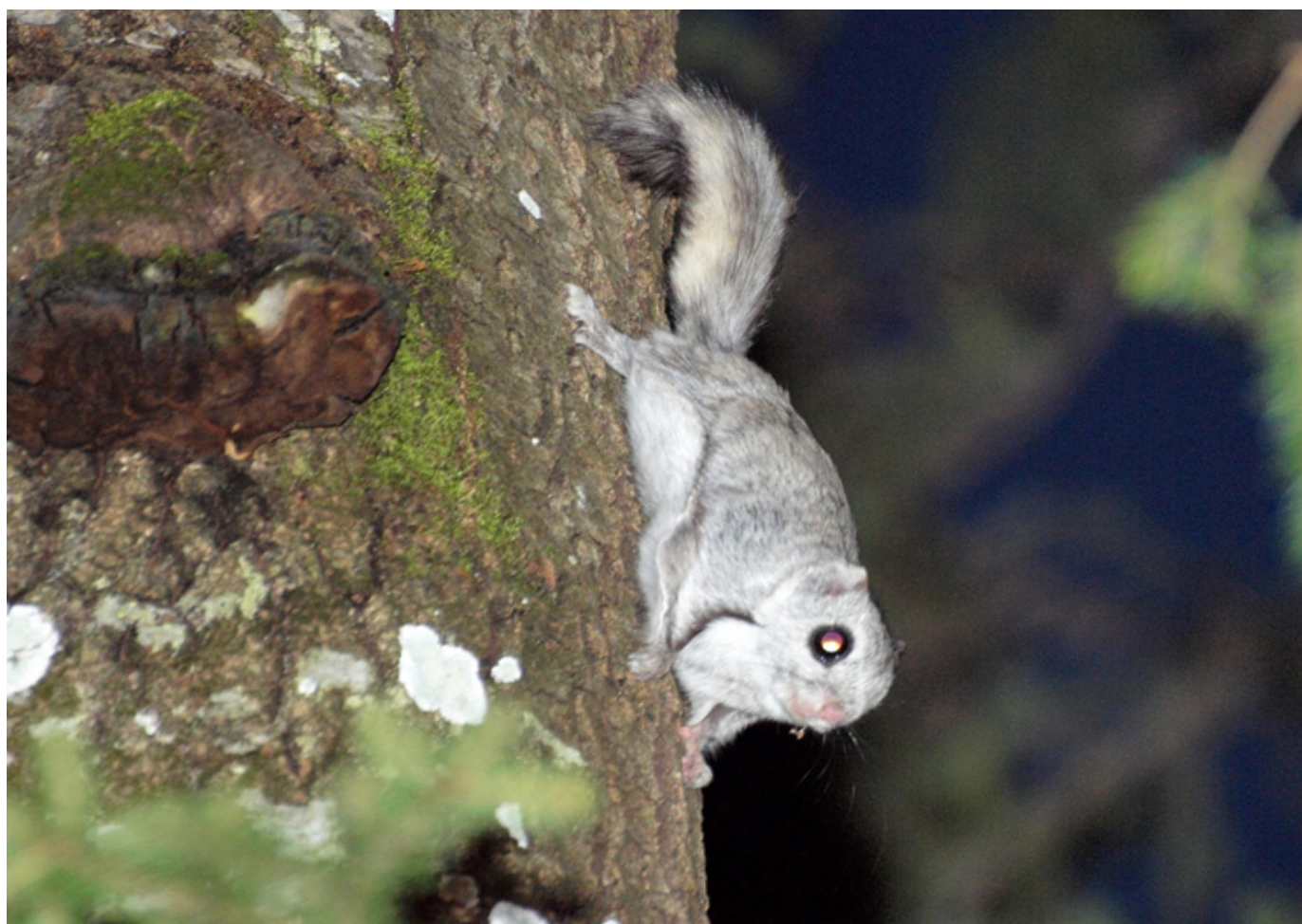
Fig. 1. Flying squirrel, Pteromys volans , in neighbourhood of Petrozavodsk.

Information on flying squirrels in Central Siberia comprises of fragmentary data in species studies (Kokhanowski, 1962). We have found that the flying squirrel is a regular species in the forests of the lower and middle mountains belt in Eastern Sayan. Animals willingly occupied nesting boxes for owls. In every case we registered breeding, collected data on phenology and other biology aspects.